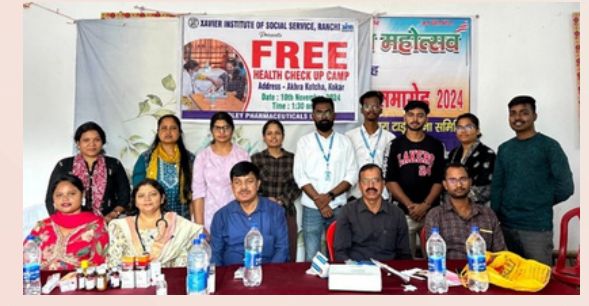
Free Health Check-up & Awareness Camp at Akhra Kotcha Slum

Haemoglobin testing to detect anaemia; and blood pressure checks for early detection of hypertension. A total of sixty-eight patients were screened during the camp. Among them, 9 patients were diagnosed with anaemia, including one severe case of acute anaemia that required immediate attention. The response from the