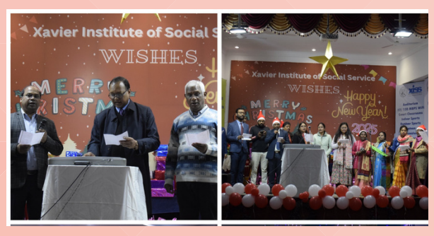
XISS celebrated the Christmas Spirit

XISS, Ranchi, celebrated Christmas Gathering for its faculty, staff, and students spreading festive cheer across the campus. The gathering began with an inspiring speech by Director, XISS, who emphasized saying that Christmas is a celebration of everyone and a time for fostering peace, justice, and