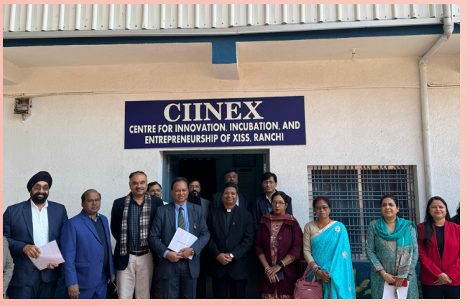
Innovation and Entrepreneurial dreams find a platform with CIINEX

XISS, Ranchi, inaugurated the Centre for Innovation, Incubation, and Entrepreneurship of XISS (CIINEX) on its campus on 6 December 2024. This initiative marks a significant step in fostering a culture of innovation and entrepreneurship, focusing on providing support to students, tribal communities, and aspiring entrepreneurs to create sustainable solutions.