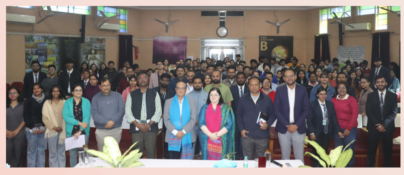
Leadership Talk on Environmental, Social, and Governance (ESG) organised

'How is one is able to envision the future and prepare themselves' and the second 'How does one create a USP'. He emphasised on the business opportunities in today's time like mental wellbeing being a rising business. He talked about the climate change concern across the globe, the movement of demographics in present context, and how a growing economy means a growing population.