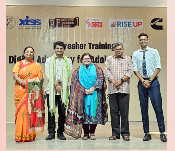
Training of Digital Advocates for Adolescent Health Fellows organised