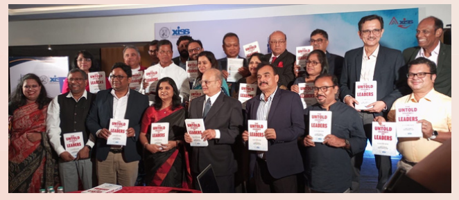
Dignitaries release the book 'The Untold Journey of Leaders'

To read more, click on the link: <u>https://xiss.ac.in/readmore/xiss-xaah-organise-alumni-meet-in-hyderabad</u>