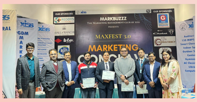
Students during a Panel Discussion organised at "MAXFEST- 3.0"

The XISS campus buzzed with excitement as competitive events unfolded. Rural La Carte was a live sales competition where students showcased their ability to sell rural products. Case Clash challenged participants to solve