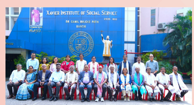
FDP on Business Education and Industry 5.0 organised for JIM Trichy Faculty

Director, XISS discussed this initiative to enhance educators on the evolving landscape of business education in the context of Industry 5.0, importance of human-centric approaches, sustainability, and advanced technology integration were the agenda of this FDP.