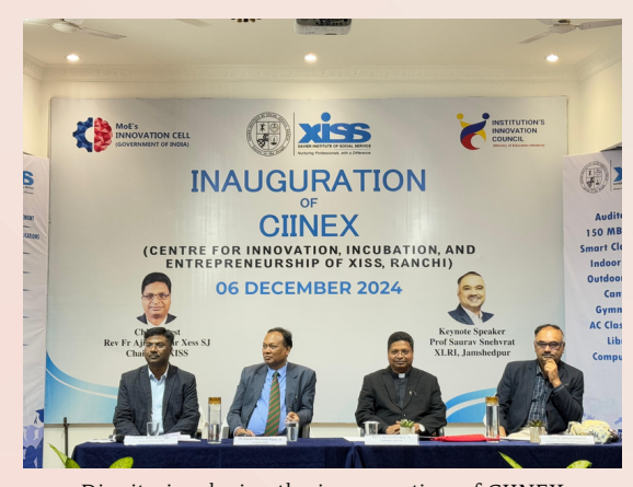
Dignitaries during the inauguration of CIINEX